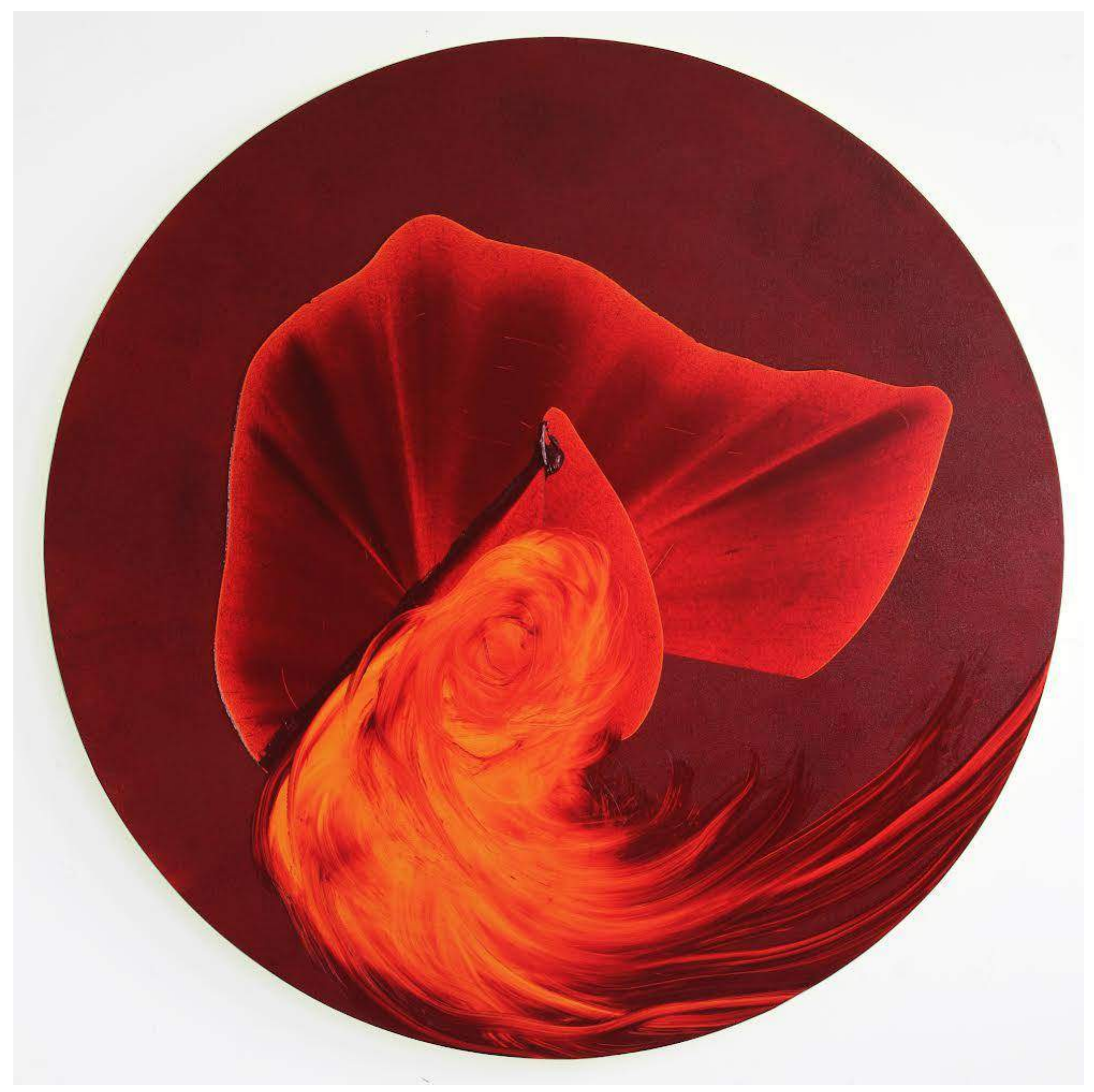
Untitled, 2021 Alyzarin crymson in oil on canvas 200 x 200 cm