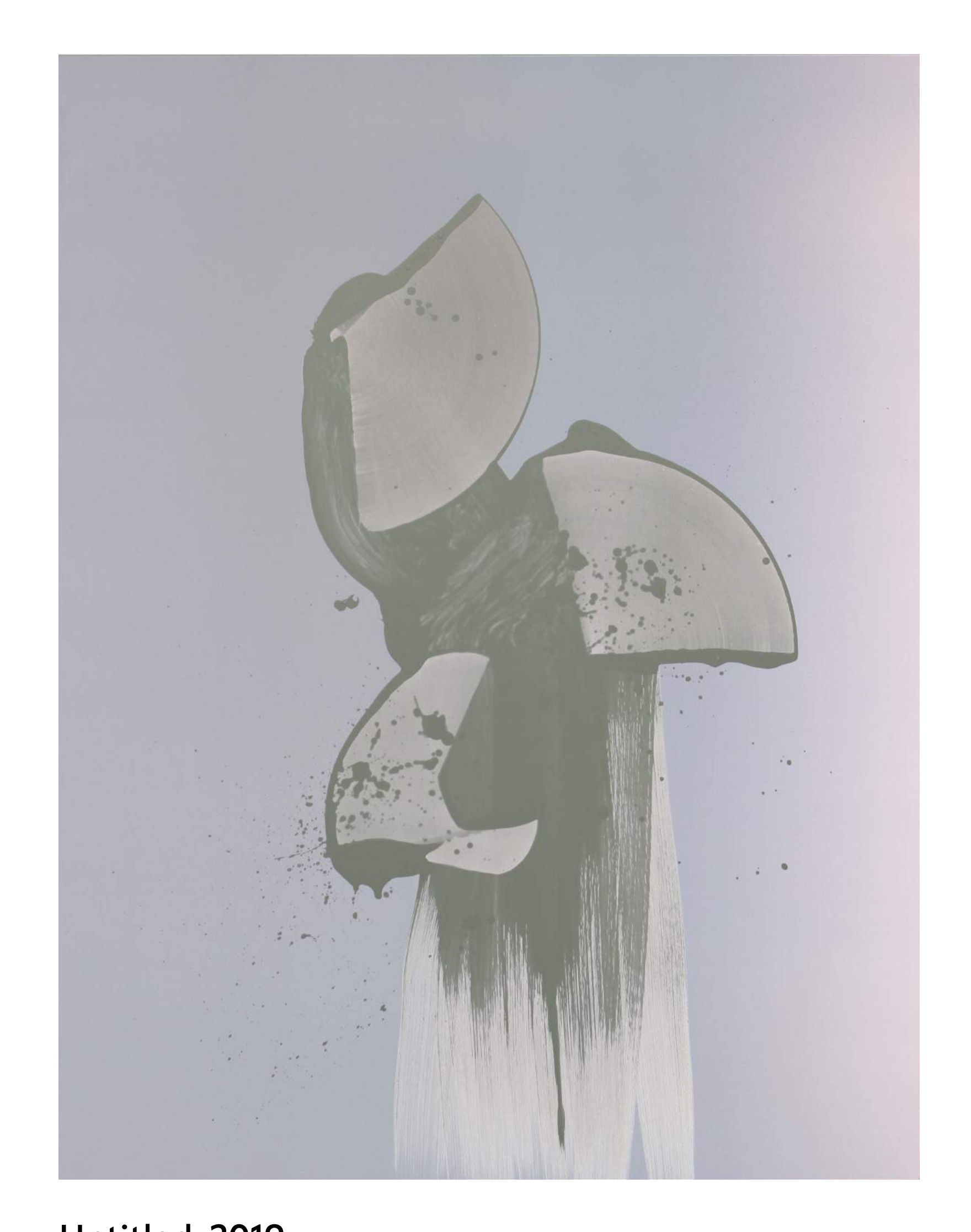
Untitled, 2019 Lacquer on retroreflective fabric 130 x 100 cm