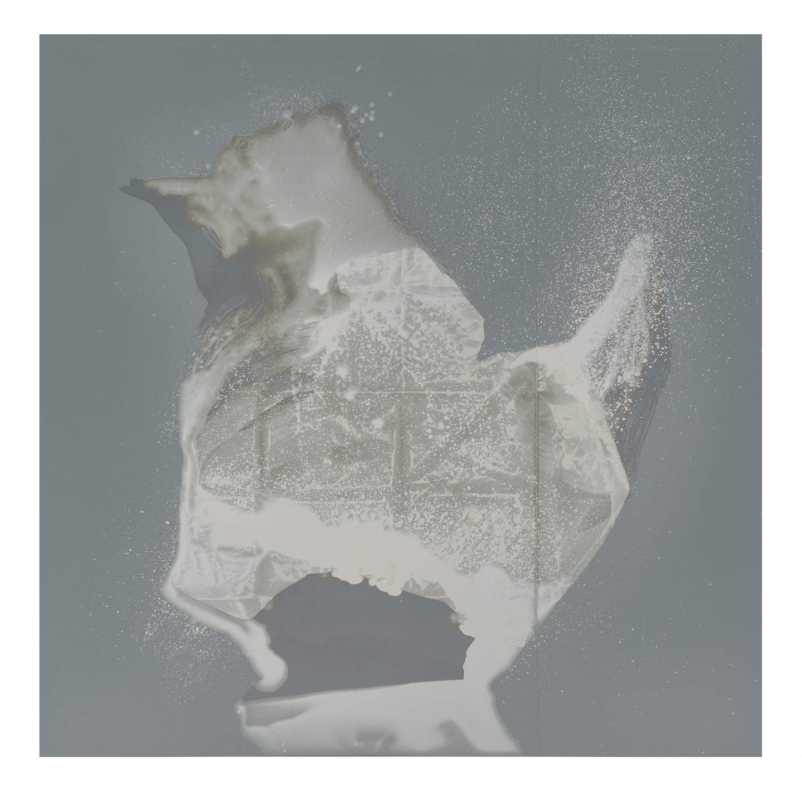
Untitled, 2017 Lacquer on retroref

Lacquer on retroreflective fabric on canvas 200 x 200 cm