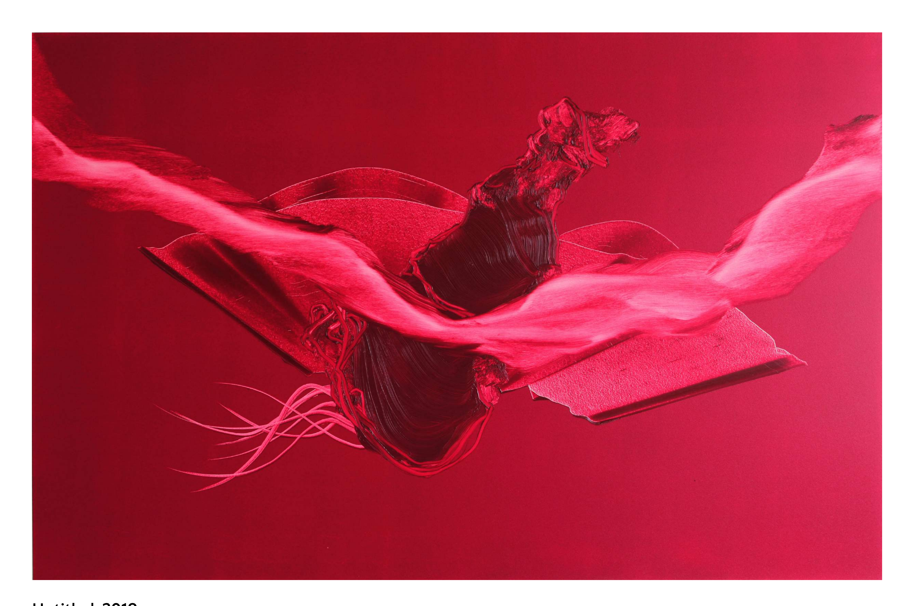
Untitled, 2019 Alyzarine crymson in oil on canvas 130 x 200 cm