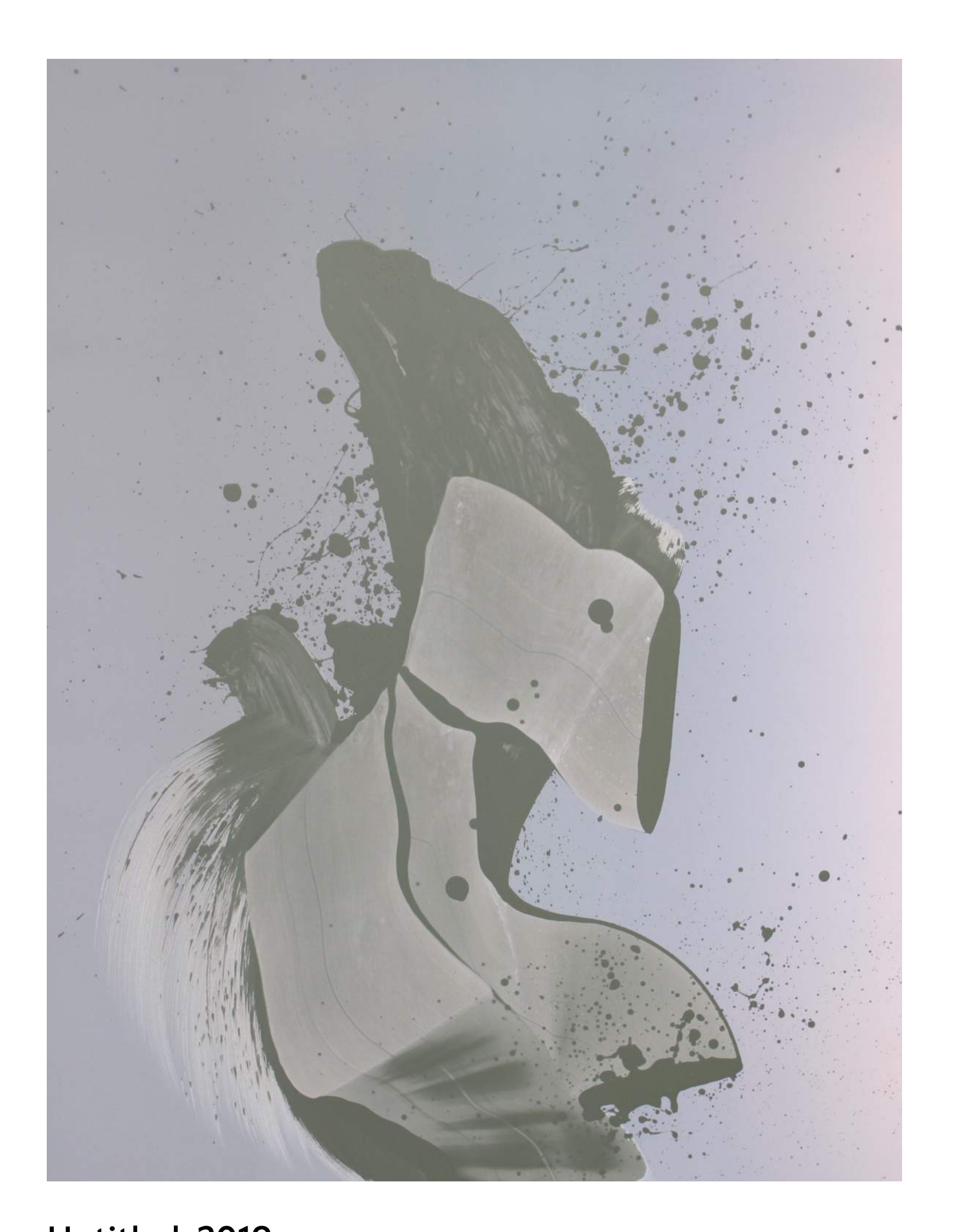
Untitled, 2019 Lacquer on retroreflective fabric 130 \times 100 \text{ cm}