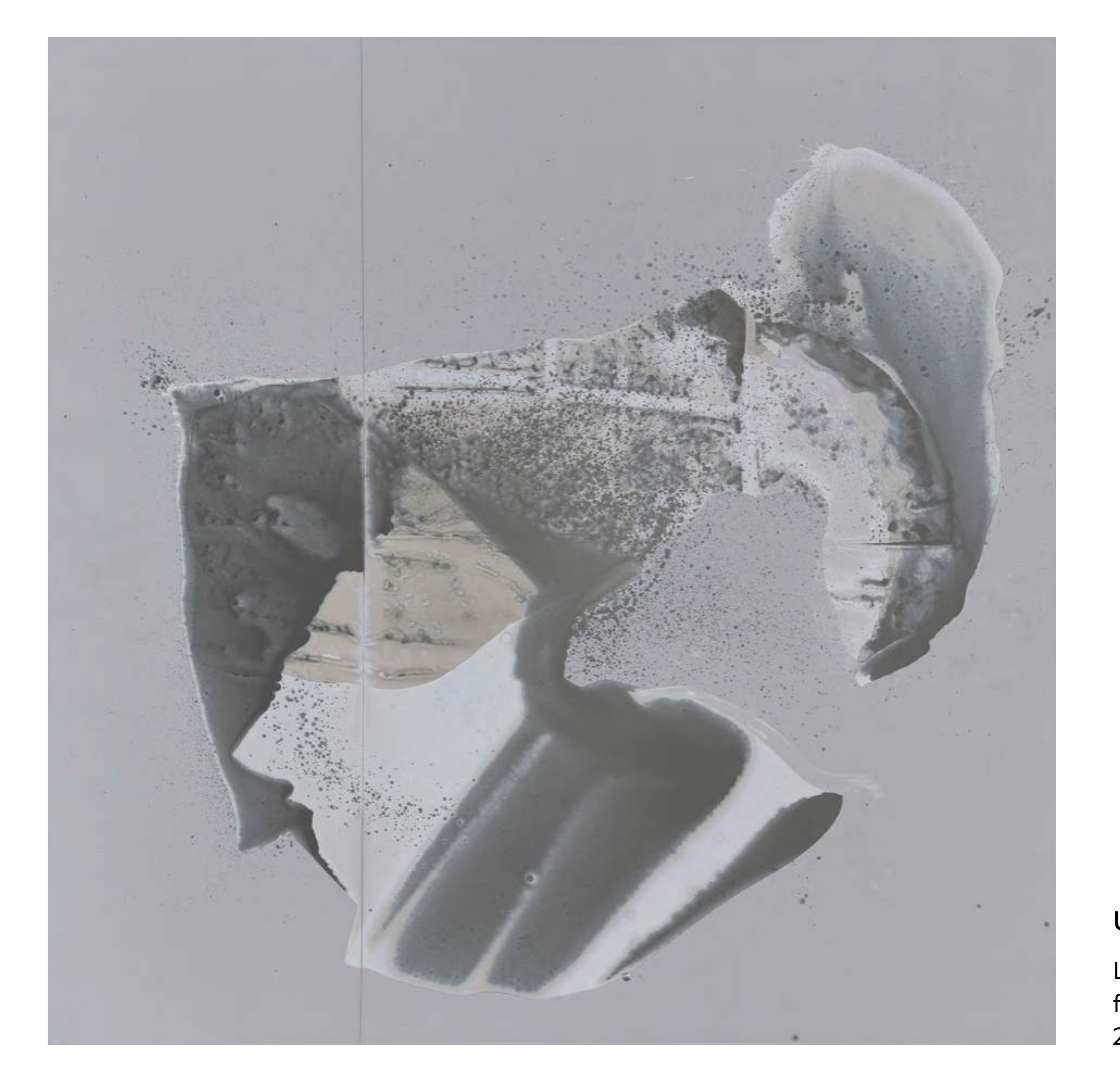
Untitled, 2017 Lacquer on retroreflective fabric on canvas 200 x 200 cm