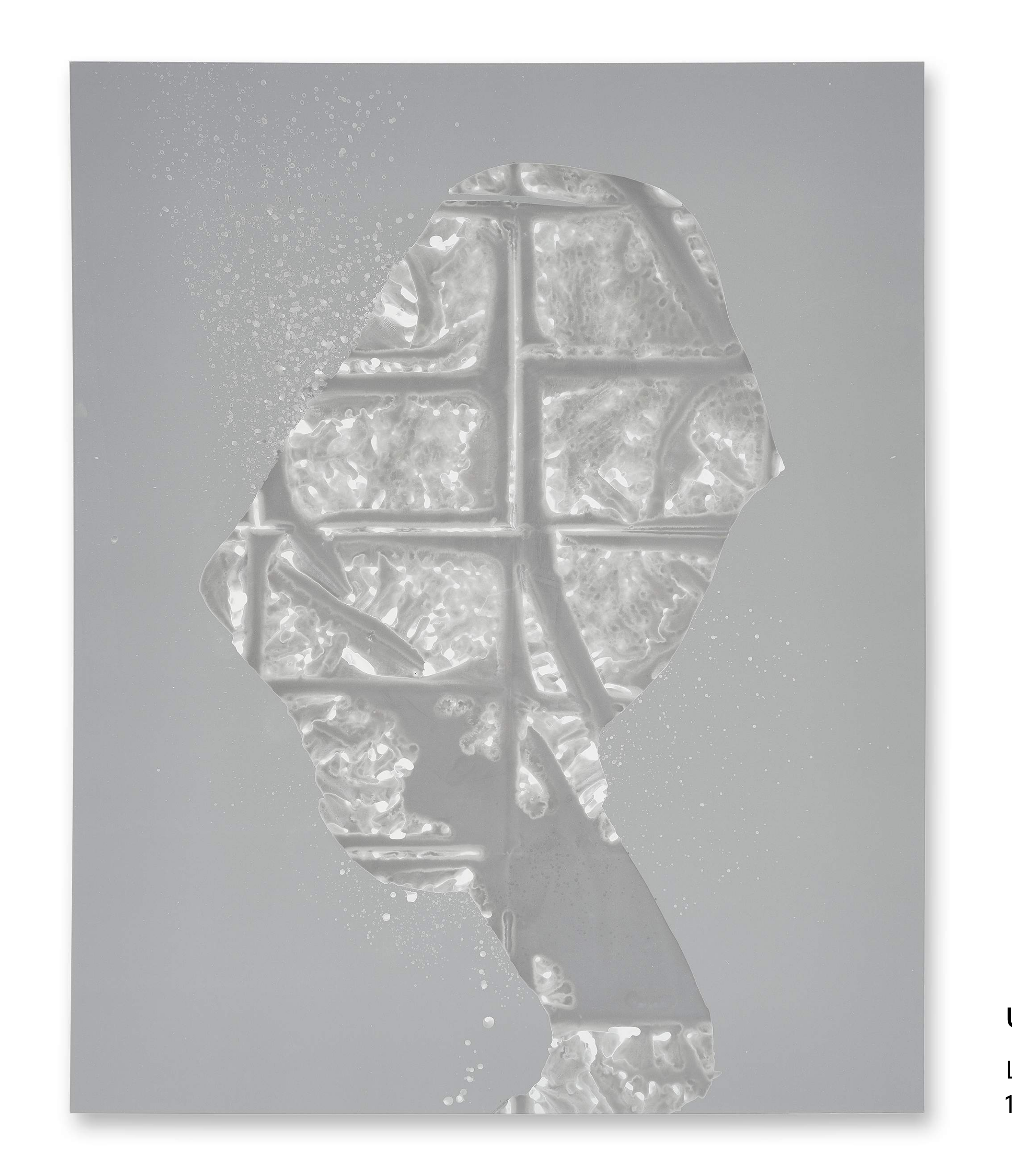
Untitled, 2017 Lacquer on grey retroreflective fabric 160 x 130 cm