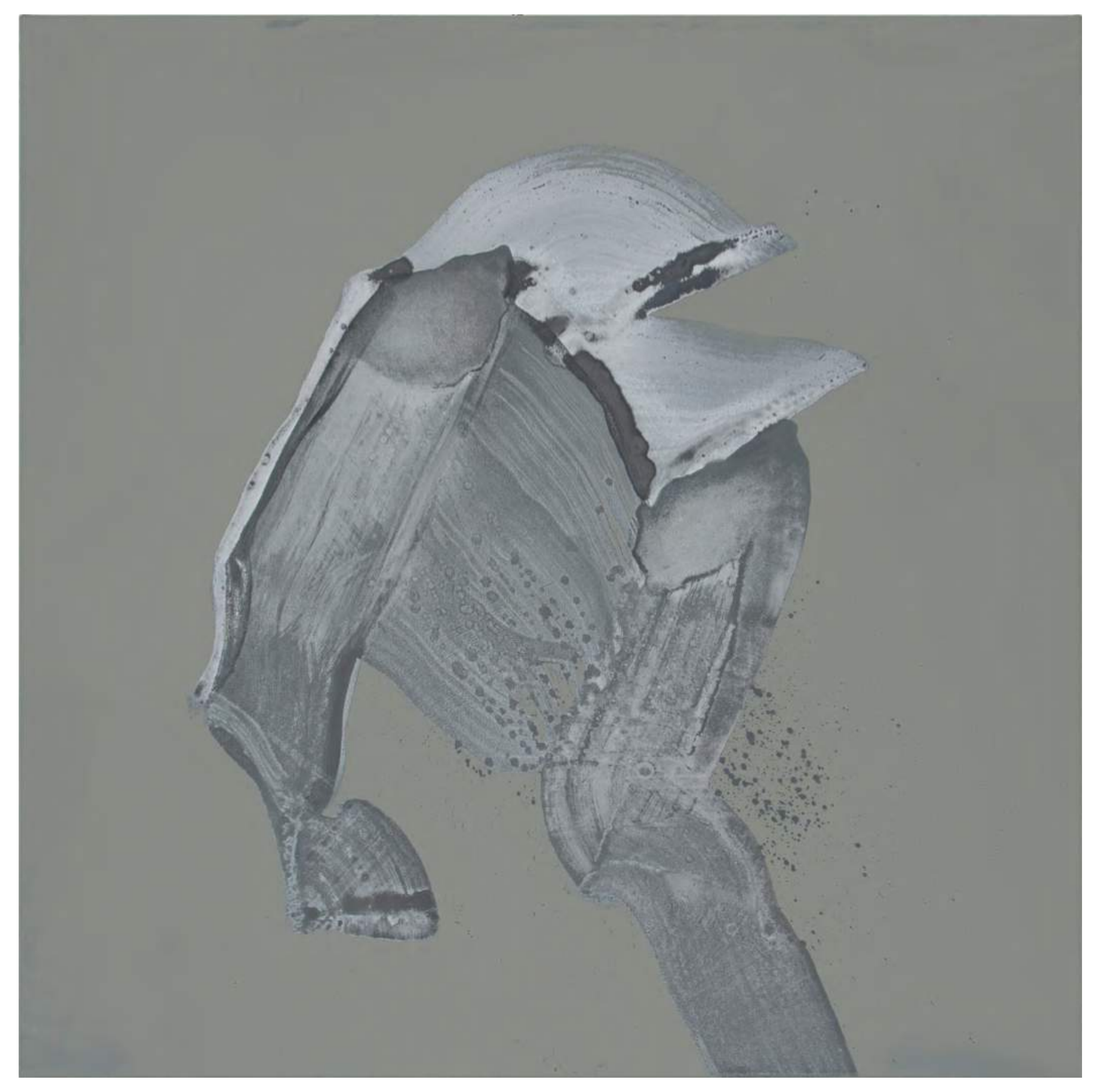
Untitled, 2015 Water on pulverized zinc on canvas 100 x 100 cm